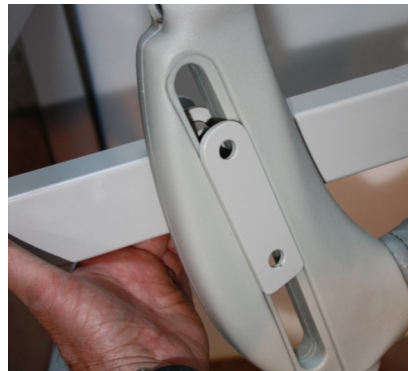
Align slot in the leg lifter with the holes in the clamp and fit the washer with the small holes over the clamp