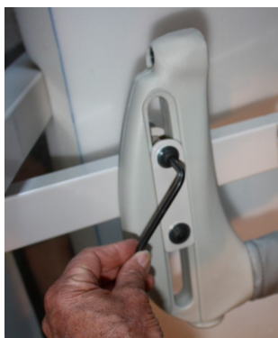
Tighten the bolts