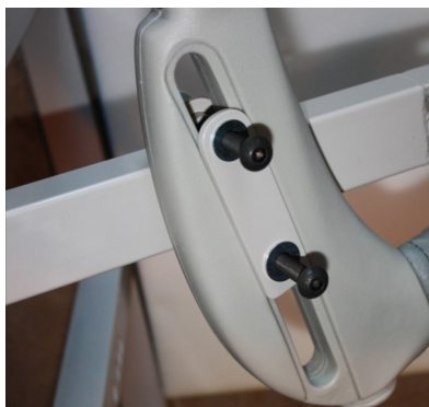
Screw in the two bolts