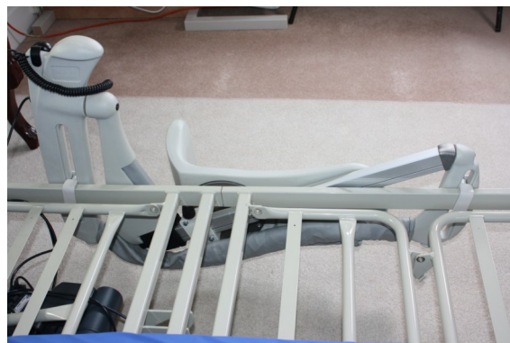
Position the leg lifter where you want it on the bedside. Ensure it is also the correct height.