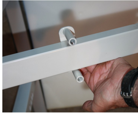
Fit the clamp over the side rail of the bed