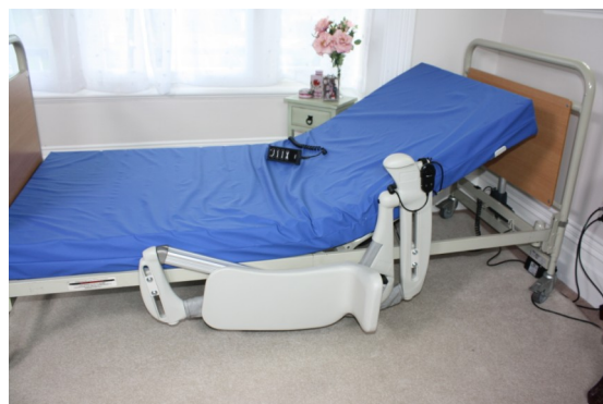
Check that the leg lifter works freely