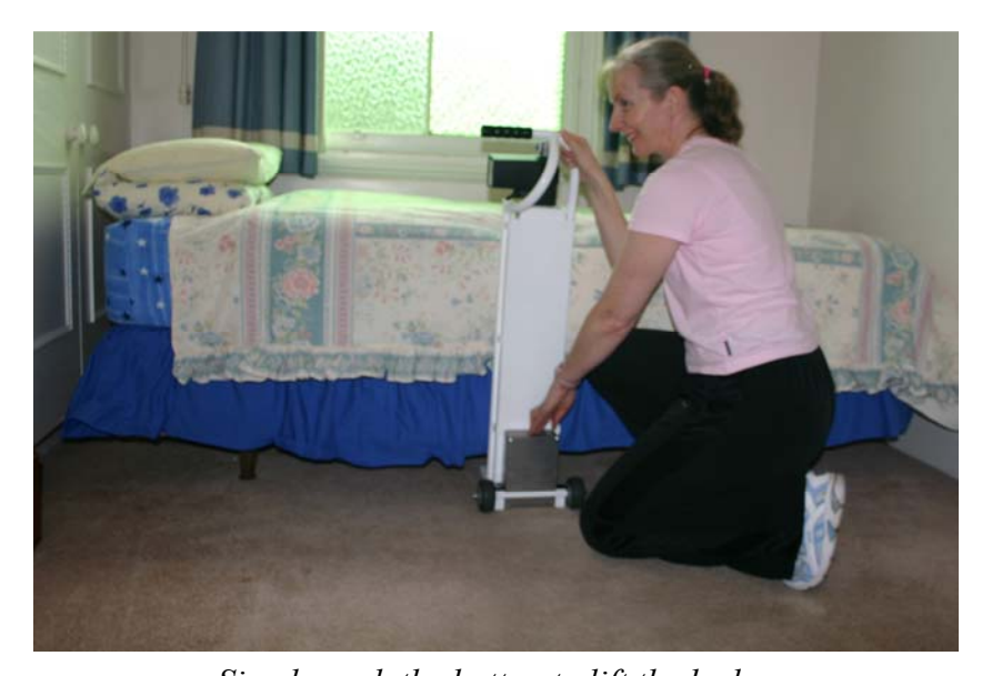
Simply push the button to lift the bed