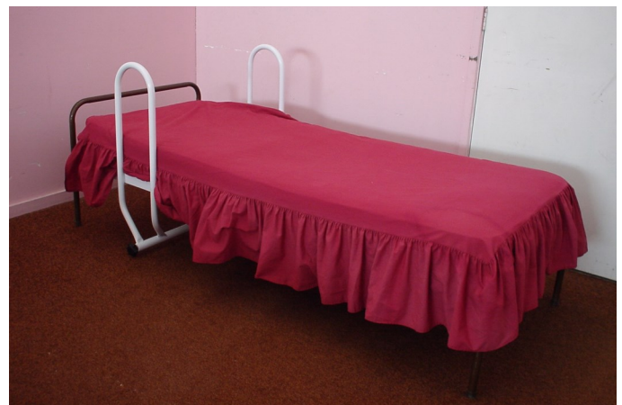
The rail fitted to a clients bed