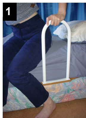
1 Slim profile against the bed prevents injuries.