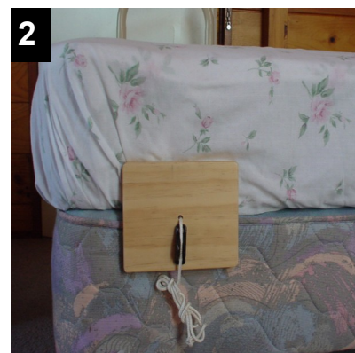
2 Cord and cleat tie off on the other side of the bed to prevent the Bed lever from pulling out from the bed.